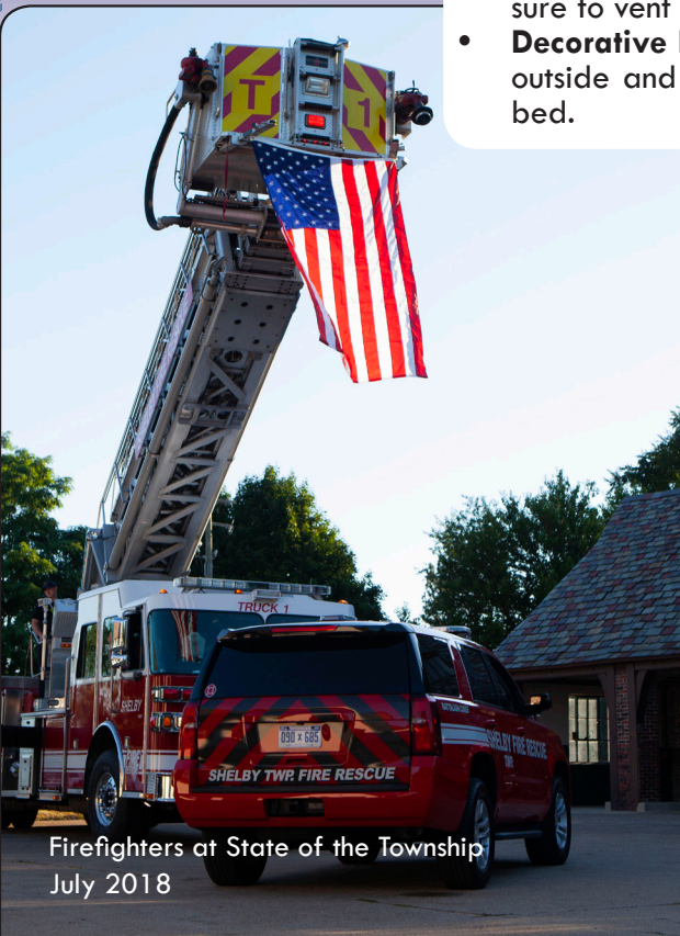
Firefighters at State of the Township July 2018