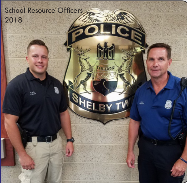
School Resource Officers 2018

The Shelby Township Police Department is hosting the community shred day this year so everyone can properly dispose of all their important papers without risk of your information being stolen. Bring your paper to the Municipal Grounds for proper disposal.