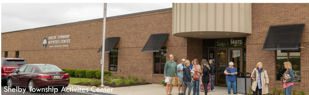
Shelby Township Activities Center