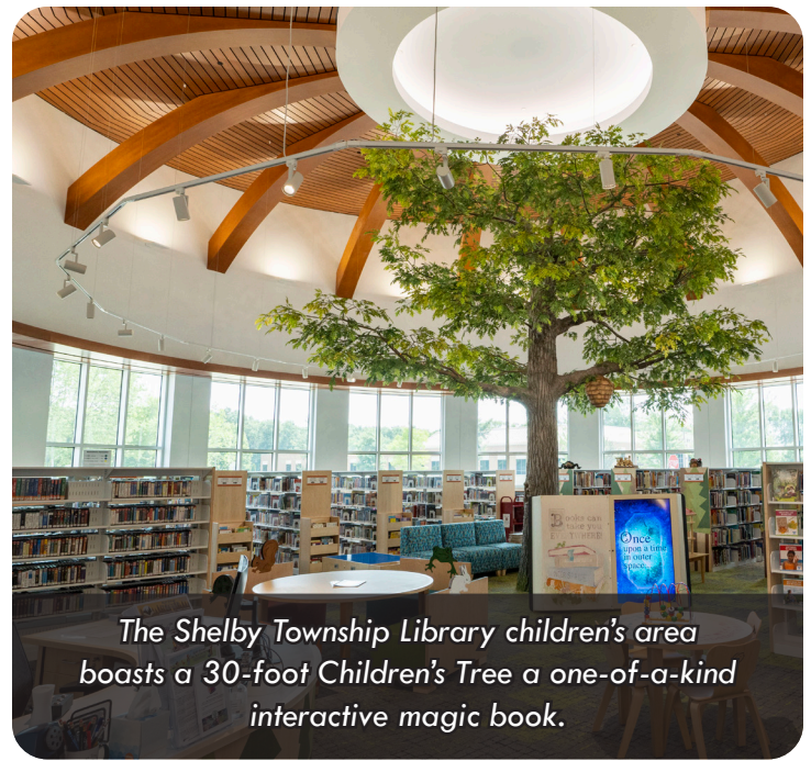
The Shelby Township Library children's area boasts a 30-foot Children's Tree a one-of-a-kind interactive magic book.

Late fines for these items are $1.50/per day overdue.