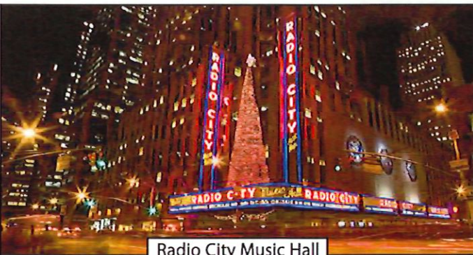
Radio City Music Hall