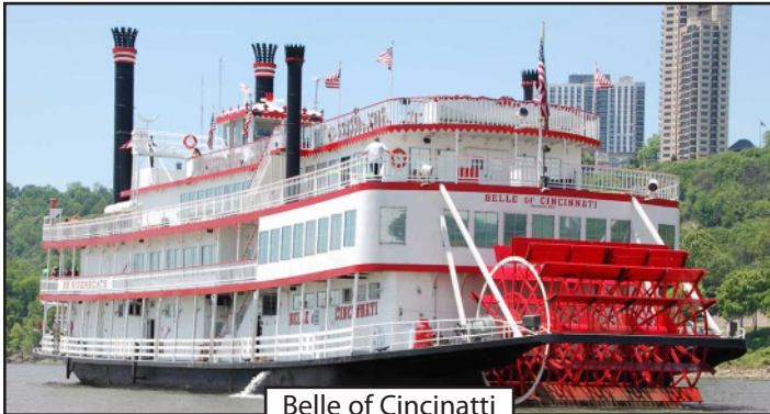
Belle of Cincinnati